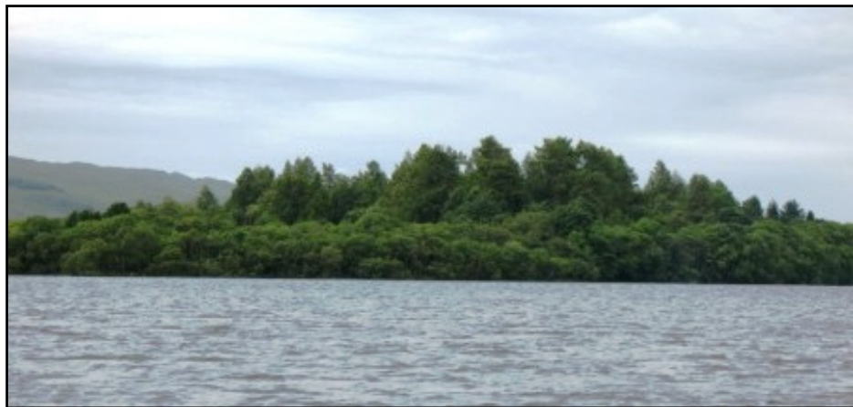
Figure 3. The sacred Isle of Innishail in Loch Awe where some of the Macnachtan Chiefs are buried.