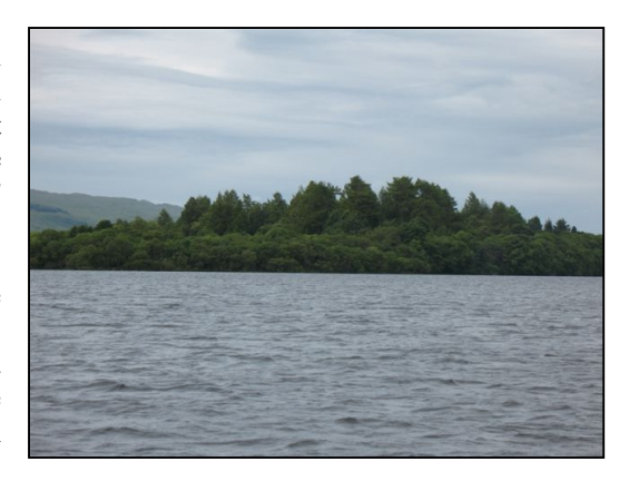
Figure 3. Inishail, Isle of the Dead, Loch Awe

The Clan MacNaghten fought in the Jacobite army supporting Charles and the Stuarts in this climactic battle; the Campbells supported the British government. Jacobites who were not killed in the battle were executed, imprisoned, transported to the colonies and banished. The clan system was destroyed, the clans were disarmed, and the kilt and the tartans were banned. Those who supported the British army were rewarded with titles and given confiscated lands.