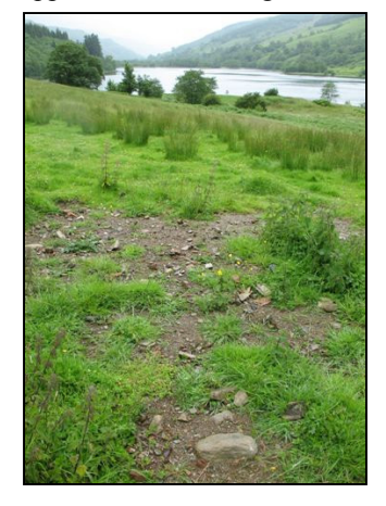
Figure 15. Odd stones outcrop here and there above the turf.

that condition for a very long time. Odd stones, singly and in groups, outcrop here and there above the turf, or [are] embedded in it (Fig. 15), and can be felt everywhere underneath with a probe. No built faces of masonry are visible, and such stones as do appear bear no traces of mortar. The mound lies more to the SE side of the complex, and one has the impression that the whole may consist of a main building and courtyard; the entire mound, in fact, could be nothing more than collapsed stonework. Under the surrounding turf of the remainder of the promontory, stone can also be felt with a probe, and there is the possibility of a causeway, or paved area here, but the site may have been at least partially surrounded with water when the buildings were in occupation." This must have been a minor castle.