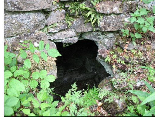
Figure 7. Niche inside castle

Hugo Millar's description of Fraoch Eilean [Ref. 1] still holds true today: "Foundations of stone walling appear here and there about the island but the main building still bulks largely on the landscape. It consists of a substantial stone hall, now very ruinous, and measuring some eighty feet by thirty and having at its east end a tower-house [Fig. 5] in what appears to be sixteenth century style, erected on the older hall masonry."