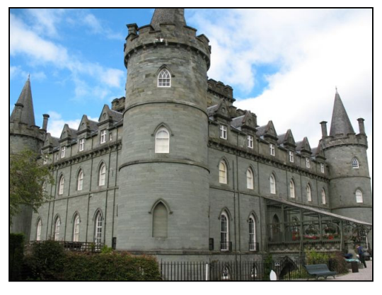
Figure 4. Inveraray Castle

The Clan system flourished in the Scottish Highlands between the 12<sup>th</sup> and 18<sup>th</sup> centuries. It was based on strong leaders who provided protection for their followers in exchange for fierce loyalty. All around the world Scots keep clan traditions by wearing the kilt and, for formal occasions, a Bonnie Prince Charlie outfit.