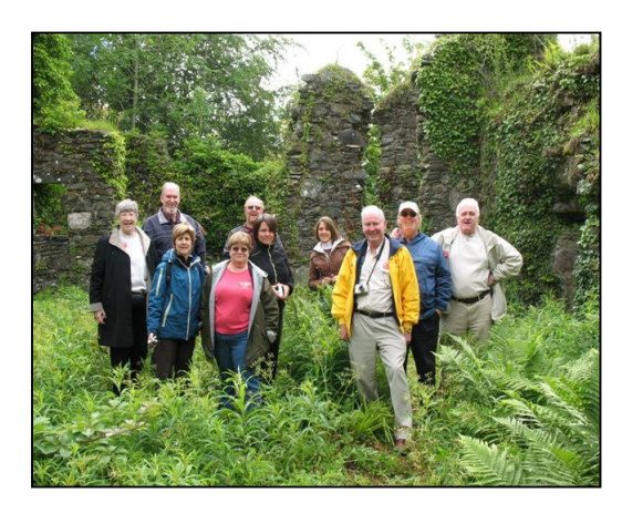
Figure 10. Clan Macnachtan Association members in the castle of Fraoch Eilean

"The interior is divided by a wall extending across the building somewhat nearer its eastern end. In the smaller enclosure there are still visible the remains of chimneys, curious niches [Fig. 7] and windows, but all is covered with ivy and ferns . . . on the south side of the castle are the foundations of a massive wall extending right across its front, but for what purpose it was built we do not know."