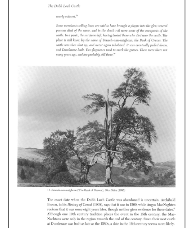
Figure 4. Matthew Cock took a photo of these two trees on the southern shore of Dubh Loch for his book [1].

Cock rightly attributes this portion to Ref 7, page 37, and also refers to MacIntyre [13] about the Bank of Graves, which is discussed elsewhere [2]. MacIntyre says the castle was on the western shore (Fig. 3). Cock took a photo (Fig. 4) in 1998 titled " Bruach-nan-naighean , the Bank of Graves," showing two trees on the southern shore of Dubh Loch, just south of where the Inveraray Castle map shows the MacNaughton castle site. He does not say how he concluded this is the location of the Bank of Graves. It does seem clear the castle was built on a crannog and the burials may have been made on the southern shore. Later, the crannog may have become attached to the shore as a promontory. It would be nice to find the two flagstones; excavations on the bank may turn up something interesting. I have a photo of the same two trees in 2004 (Fig. 5) and one in 2007 (Fig. 6) that shows the larger tree disappeared. The smaller one seemed to be in its last throes or may have disappeared by now.