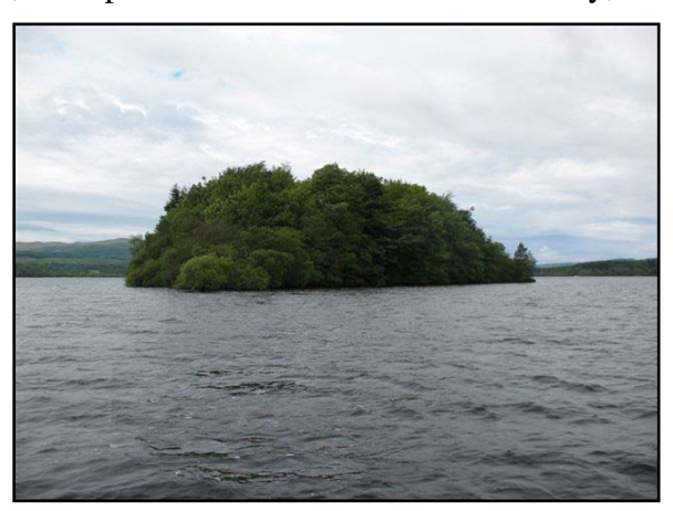
Figure 1. This crannog in Loch Awe, after being deserted for centuries, is green and rounded.