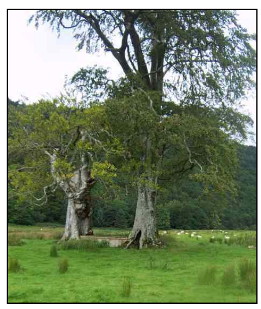
Figure 5. This photo of the two trees was taken in August 2004 on the Clan Macnachtan Tour.