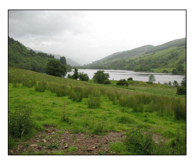
Figure 7. If you stand at the southern tip of Dubh Loch there seems to be a small crannog on the eastern shore, center right in the photo.

19. The Highland Papers, Vol. 1, available at The Scottish History Society.